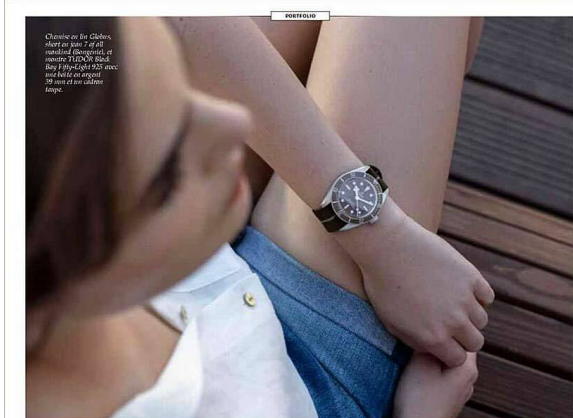
Classic on the Cobble, about on the 7 of all watches. The watch of the brand TUDOR Black Bay is a perfect choice for the occasion. It is a watch that is both elegant and sporty.