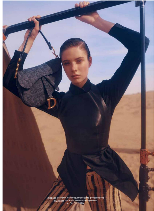
This page: Black shirt, leather top, striped pants, grey saddle bag Right page: White coat, white camouflage shorts All Dior SS20 RTW