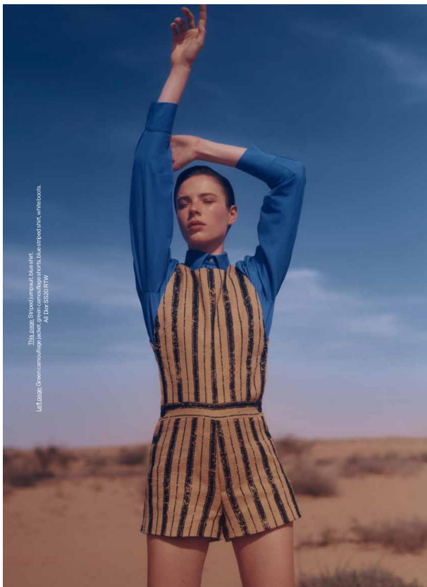
This page: Striped jumpsuit, blue shirt Left page: Green jumpsuit, blue quilted bag All Dior SS20 RTW